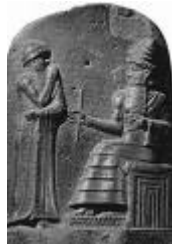
Code of Hammurabi