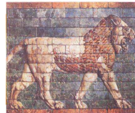
Striding Lion of Babylon

Chaldean Federation of America 30777 Northwestern Hwy. – Suite 300 Farmington Hills, Michigan 48334 Tel: (248) 851-3023 Fax: (248) 851-9551