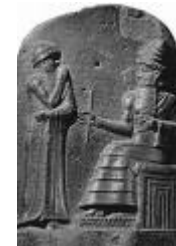
Code of Hammurabi